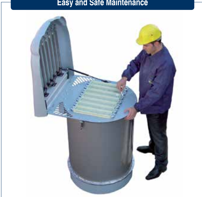
Easy and Safe Maintenance